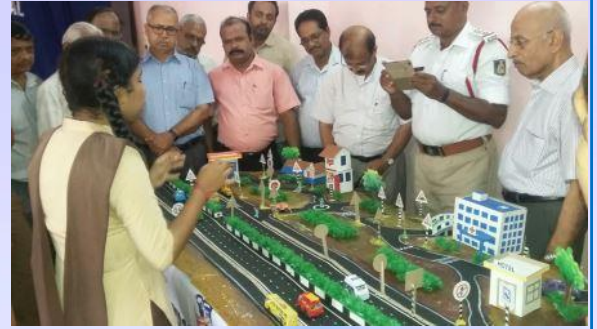
Table Top Model created by the students of Mahalingeshwara Highschool

Editorial Team: Sachi (9845871761) & Yashomathi (9844642696)